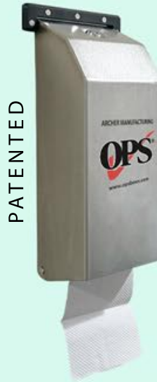
OPS® PAPER TOWEL DISPENSER 14"(H)X4.75"(W)X3.9"(D) SKU: 1250-01G