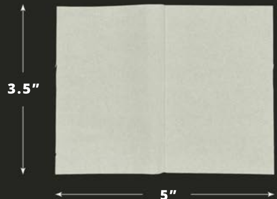
OPS Toilet Paper