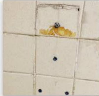
RIPPED OFF THE WALL