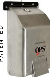
OPS® SOAP DISPENSER 11"(H) 6.5"(W) 4.5"(D) SKU: 1015-01G