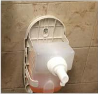
NO MORE BROKEN DISPENSERS