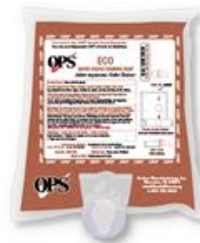
OPS® ECO ENVIRONMENTALLY FRIENDLY FOAMING HAND SOAP SKU: 1405-05G