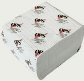
OPS® PAPER TOWELS SKU: 1260-01G