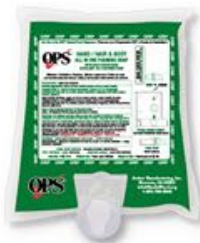
OPS® HAND / HAIR & BODY ALL IN ONE FOAMING SOAP, SHAVE CREAM, & CONDITIONER SKU: 1405-04G