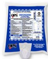
OPS® INSTANT HAND SANITIZER ALCOHOL FREE FOAMING SANITIZER EFFECTIVE AGAINST MRSA SKU: 1405-03G