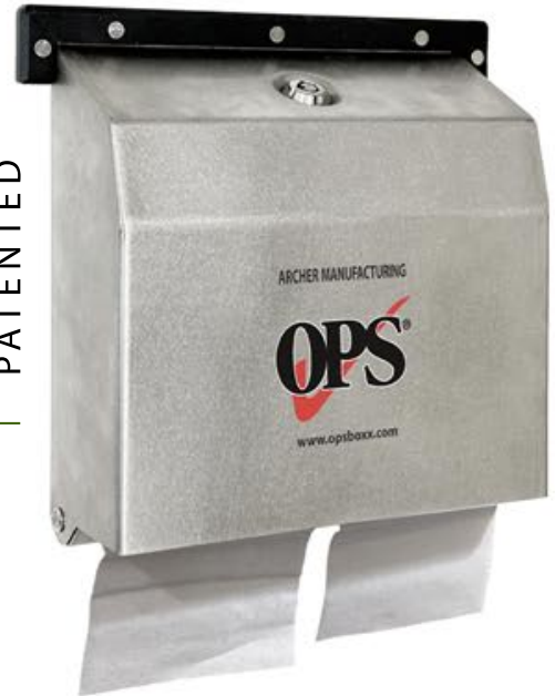
OPS® TOILET TISSUE DISPENSER 8.75"(H) 9.5"(W) 3"(D) SKU: 1220-01