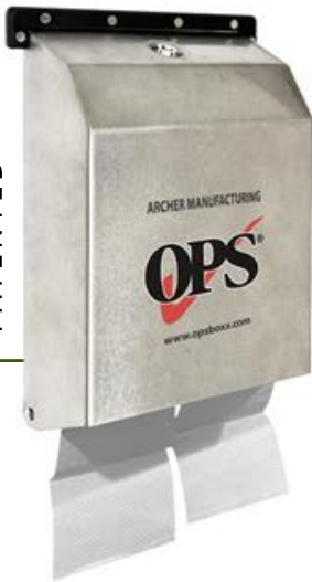
OPS® HIGH CAPACITY PAPER TOWEL DISPENSER 14"(H) 10.125"(W) 3.9"(D) SKU: 1100-01G