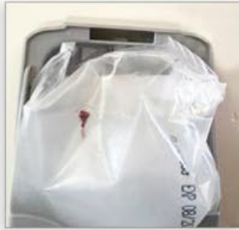
CLEAN HEROIN NEEDLES