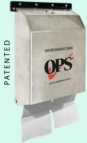
OPS® HIGH CAPACITY PAPER TOWEL DISPENSER 14"(H)X6.5"(W)X4.5"(D) SKU: 1100-01G