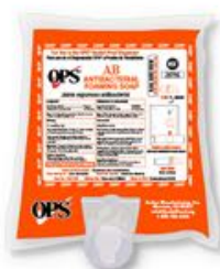
OPS® AB ANTIBACTERIAL FOAMING SOAP EFFECTIVE AGAINST MRSA SKU: 1405-02G