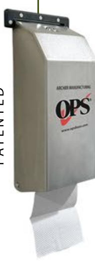
OPS® PAPER TOWEL DISPENSER 14"(H) 4.75"(W) 3.9"(D) SKU: 1250-01G