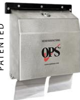
OPS® TOILET TISSUE DISPENSER 8.75"(H) 9.5"(W) X3"(D) SKU: 1220-01